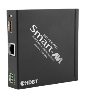
HDX-POE-PRO SIDE B