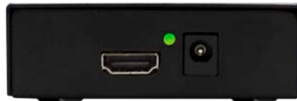
HFX (TX/RX) Front