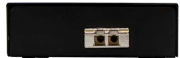
HFX (TX/RX) REAR