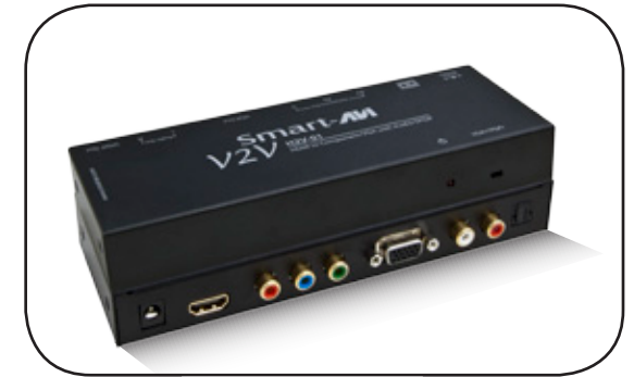
HDMI to Component/VGA Converter