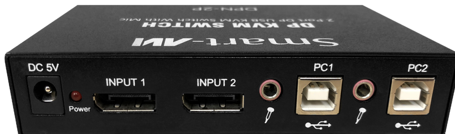
FIGURE 5-1 DPN-2P REAR