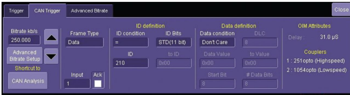
Figure 2: The CAN Trigger setup qualified by the amplitude of channel 2

The message content can be read and converted by the unique CAN Bus TDM parameter “CAN to Value.” The time aligned track of the parameter values is shown in trace F1 in Figure 1. The CAN Bus TDM display, trace CA in Figure 1, shows a half second of CANBus traffic. The CAN Zoom expands the view of the message that triggered the scope, decoding the ID, DLC, DATA, and CRC fields of the CAN message.