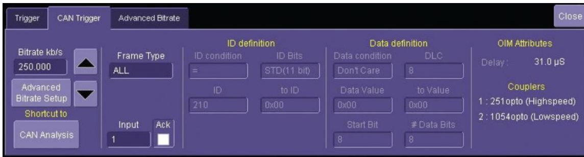
Figure 4: For the glitch trigger setup, the CAN Trigger is accepting all message frames

CANbus TDM extends the usefulness and power of the scope. It has been seamlessly integrated into the fabric of the instrument so that all the existing features can be used with the CANbus trigger, decode measurements, and graph functions.