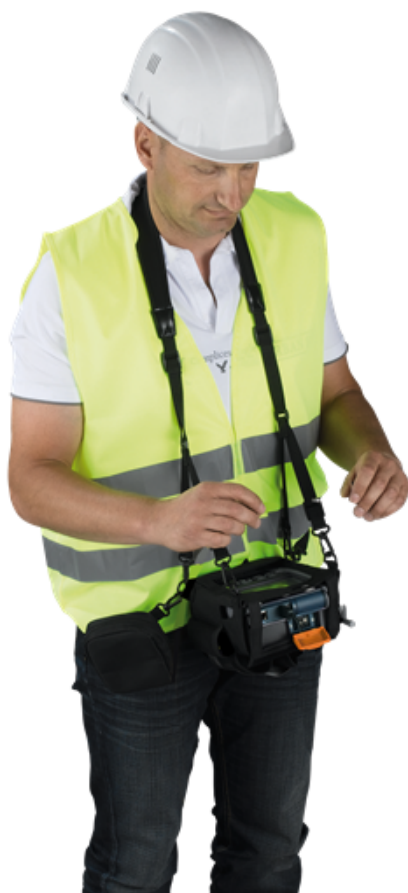
Hands-free FiberXpert strap