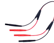
double-wire test lead 0.6 m