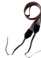
M1 hanging straps