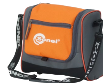
M-6 carrying case