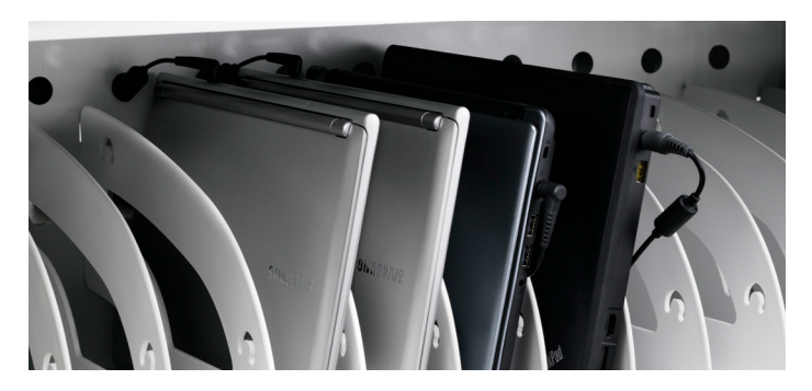
Polypropylene shelf dividers store and protect devices from scratching.

Easy rolling 5" all swivel casters for tight spaces and two can be fixed anytime to provide added directional control.