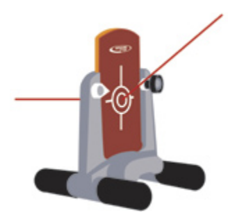
Our patented Target Lens collects the beam and transfers the spot up at the angle viewed by the pipe layer, making it very easy to see the laser beam.

LINE SET: The Line Set/Check capability of the pipe laser allows you to raise the beam outside of the trench for fast line setup or checking. Raising the laser beam out of the trench to an above-ground stake saves you time—instead of having to move the excavator off line during setup of the pipe laser, you can just get on with your job. In addition, the Line Set-Check feature is ideal for rechecking the line in pipe jacking puts after each push. Only available on the DG711.