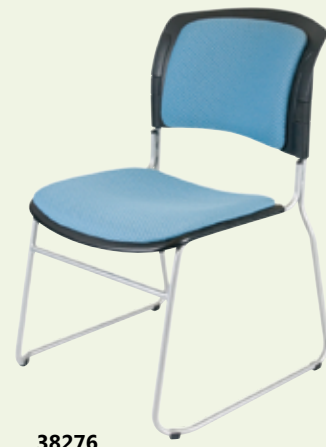
38276 Stacking Chair with fabric seat and back