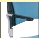
38277 Arm set