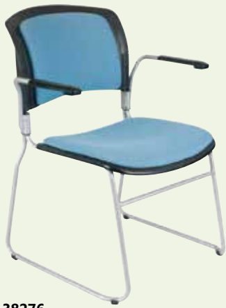
38276 Stacking Chair with fabric seat and back and arm set ( 38277 )