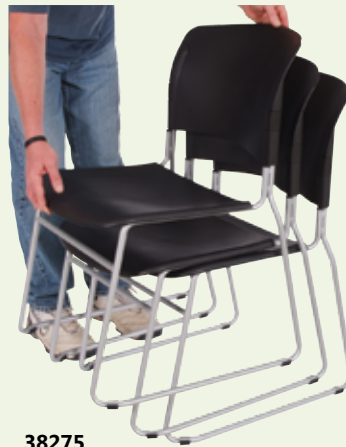
38275 Stacking Chair with polypropylene seat and back. (Sold in sets of three only)