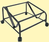
38212 Stacking Chair Dolly