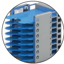
COMES FULLY ASSEMBLED