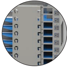
EASY CABLE MANAGEMENT