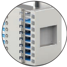
OPTION TO STACK OR HANG ON WALL