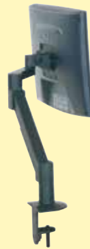
95522 B (black)