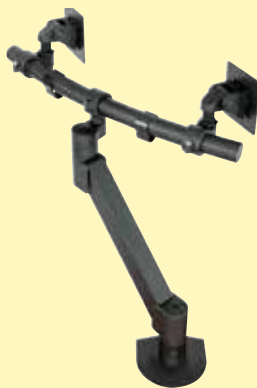
95516 B (Black)

(NOTE: You must know the weight without the base to ensure the proper arm is ordered)