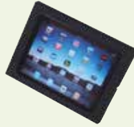
95530 iPad® Holder