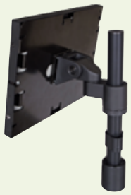
(Pole/Arm and Holder Assembly sold separately)