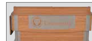
ORDER CODE 1 Custom Logo Panel with Matching Laminate (Custom Logo will increase lead time and additional charges will apply)