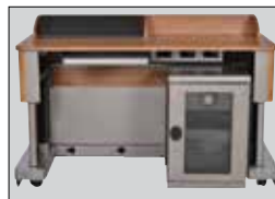
ORDER CODE L Left