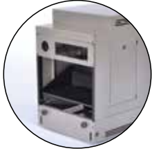
EASY-TO-WIRE ACCESS THROUGH OPEN BACK PANEL