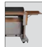
ORDER CODE D 2 Flip-Up Shelves (Customer Installed on Right and Left)