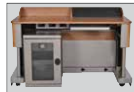
ORDER CODE R Right

Positioning of wiring panel and keyboard tray