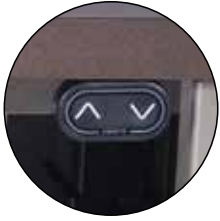
ERGONOMIC WHISPER-QUIET LIFT SYSTEM