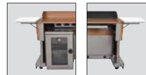
ORDER CODE E 1 Flip Up Shelf Chalk White Dry Erase (Customer Installed on Right or Left)