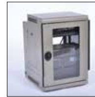
ORDER CODE 0 No Rack Cabinet ORDER CODE 3 Rack Cabinet