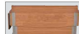
ORDER CODE 0 No Logo Panel