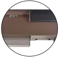
OVERBRIDGE WITH STANDARD CUTOUTS CAN BE CONFIGURED ON RIGHT OR LEFT