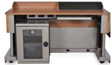
LECTERN 55289 SHOWN WITH ALL OPTIONS LISTED BELOW