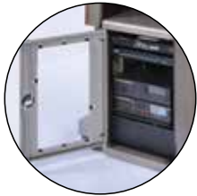
REMOVABLE DOOR OPENS LEFT OR RIGHT