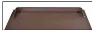
ORDER CODE S1 Surround (No Cutouts)