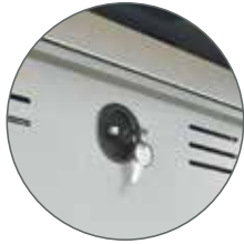
DOUBLE-BOLT KEYED SECURITY LOCK