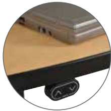
eLIFT HEIGHT ADJUSTMENT BUTTON