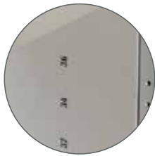
Set-and-Go HEIGHT INDICATORS