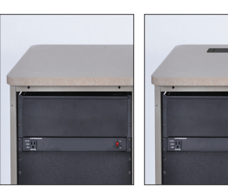
ORDER CODE 1 Equipment Rack with Standard Worksurface (No Cutouts)