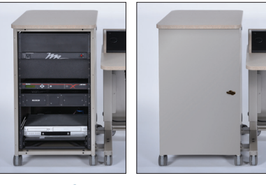
ORDER CODE 0 No Door