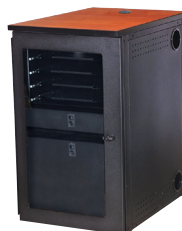
36" H Equipment Rack consisting of 68157 B and 68200 CH