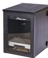
29" H Equipment Rack consisting of 68107 B and 68200 I

68204 Flip-Up Shelf is for use with full lectern only. Cannot be used with stand alone equipment rack.