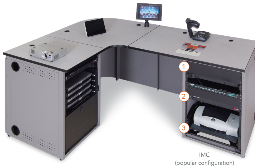
IMC (popular configuration)