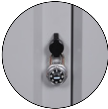
FRONT AND REAR HASP LOCK