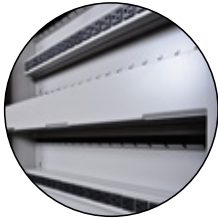
LARGE BRICK TRAY