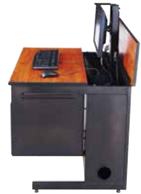
MONITOR COMPARTMENT LID PROTECTS AND SECURES THE FLAT PANEL MONITOR, KEYBOARD, AND MOUSE