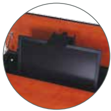
EASY LIFT MANUAL ADJUST