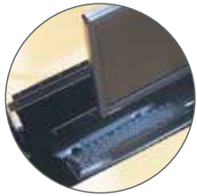
MONITOR, MOUSE, & KEYBOARD STORAGE