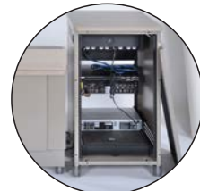
REMOVABLE BACK PANEL FOR 100% ACCESS