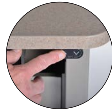
ERGONOMIC WHISPER-QUIET LIFT SYSTEM

205 Westwood Ave, Long Branch, NJ 07740 Phone: 866-94 BOARDS (26273) / (732)-222-1511 Fax: (732)-222-7088 | E-mail: sales@touchboards.com