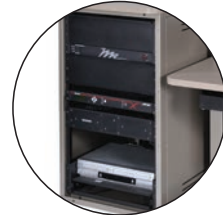
EQUIPMENT RACK MOUNTS LEFT OR RIGHT