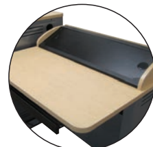
REMOVABLE PANEL ON OVERBRIDGE FOR EASY AV INTEGRATION