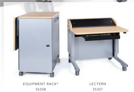
EQUIPMENT RACK* 55358