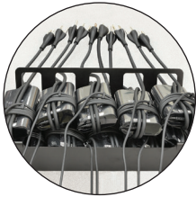
REMOVABLE WIRE AND QUICKBRICK™ TRAYS