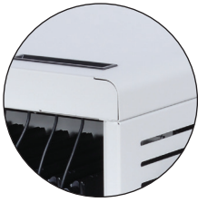
ALL-STEEL CONSTRUCTION, WITH INTEGRATED HANDLES