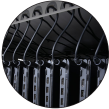
OVERHEAD WIRE MANAGEMENT