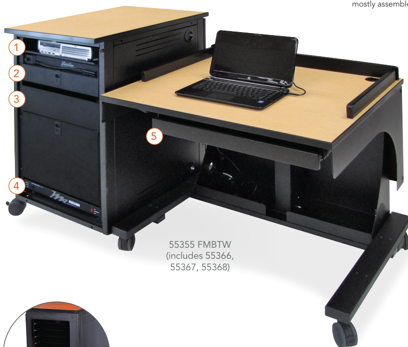
55355 FMBTW (includes 55366, 55367, 55368)