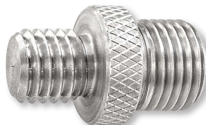
Male to Male Thread Adapter