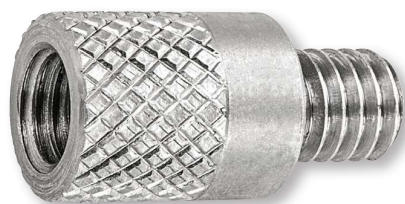
Female to Male Thread Adapters