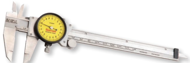
120AM-150 metric dial caliper with yellow dial