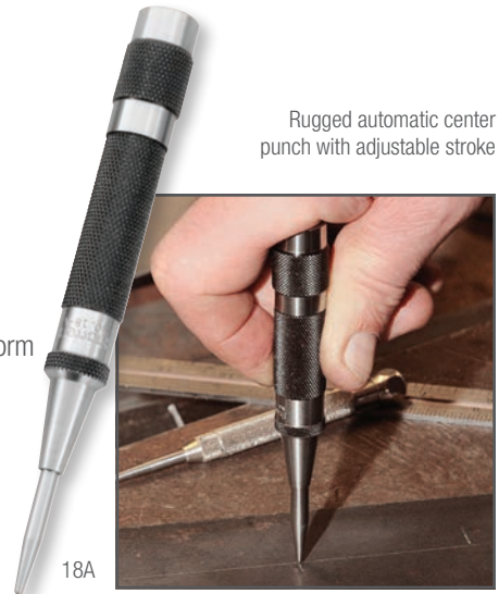
Rugged automatic center punch with adjustable stroke