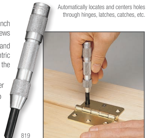
Automatically locates and centers holes through hinges, latches, catches, etc.