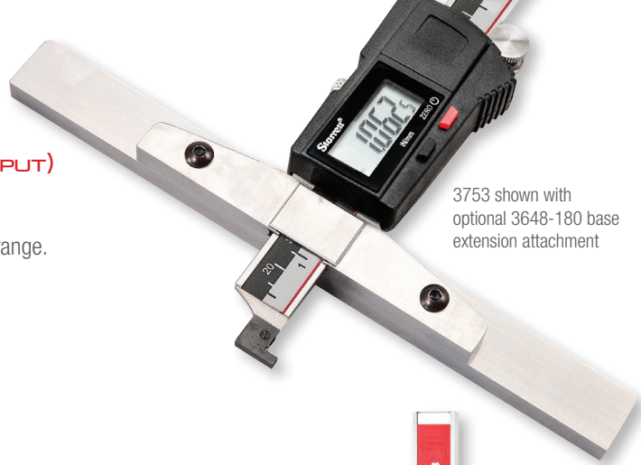
3753 shown with optional 3648-180 base extension attachment