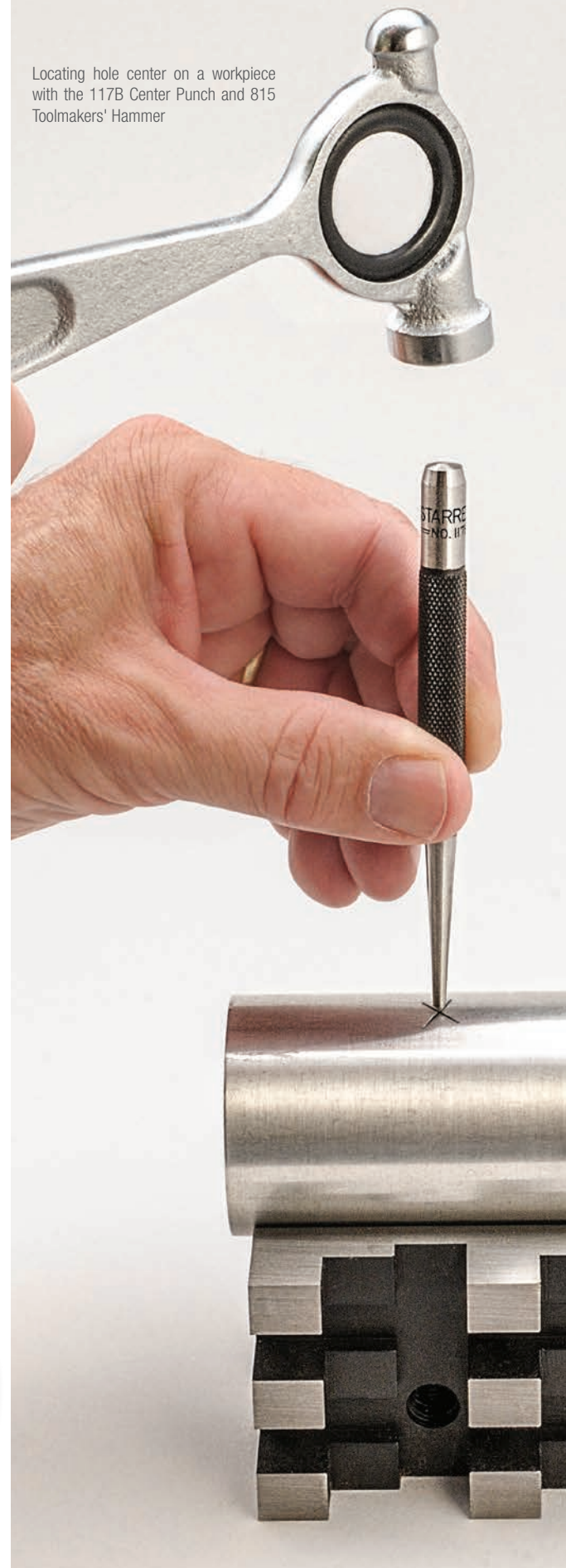
Locating hole center on a workpiece with the 117B Center Punch and 815 Toolmakers' Hammer