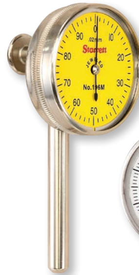
Left: 196MB1 Below: 196B1