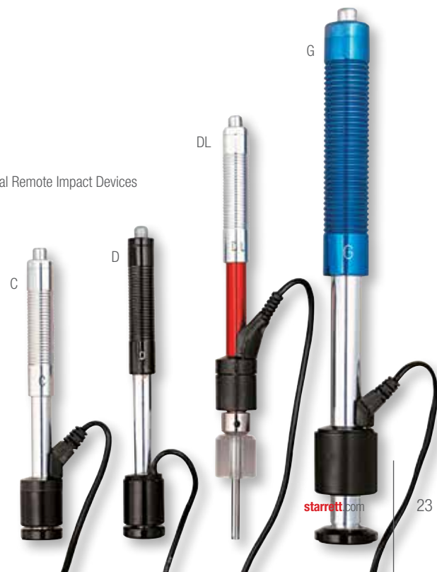
Optional Remote Impact Devices