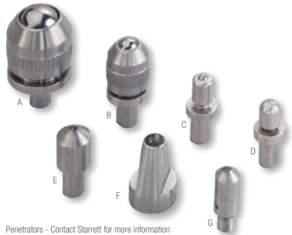
Penetrators - Contact Starrett for more information