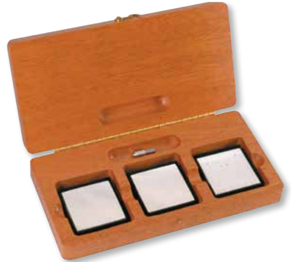
PT05272 HRC 3-Block Master Calibration Kit