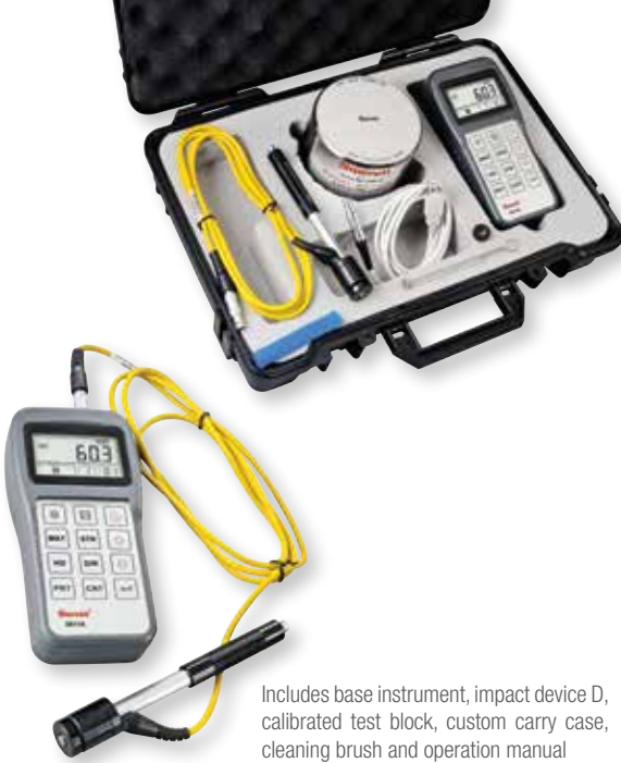
Includes base instrument, impact device D, calibrated test block, custom carry case, cleaning brush and operation manual

This compact hardness tester is loaded with useful functions usually found only on high priced models.