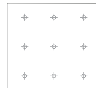
2" Dot Pattern