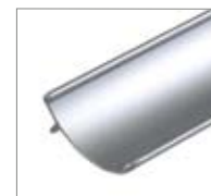
Marker Tray (Markerboard only)

Simple. Effective. Extraordinary. The way communication should be.