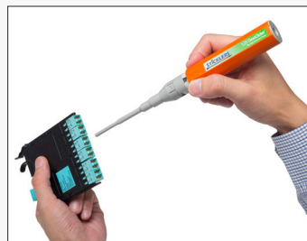
Step 2: Clean the connector end-faces to remove the contamination