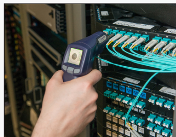
Step 1: Visually inspect the connector end face