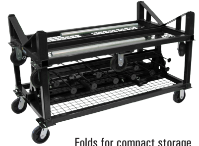
Hanger Mac II (Part # 785651)