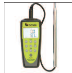
DC580 with hot-wire probe