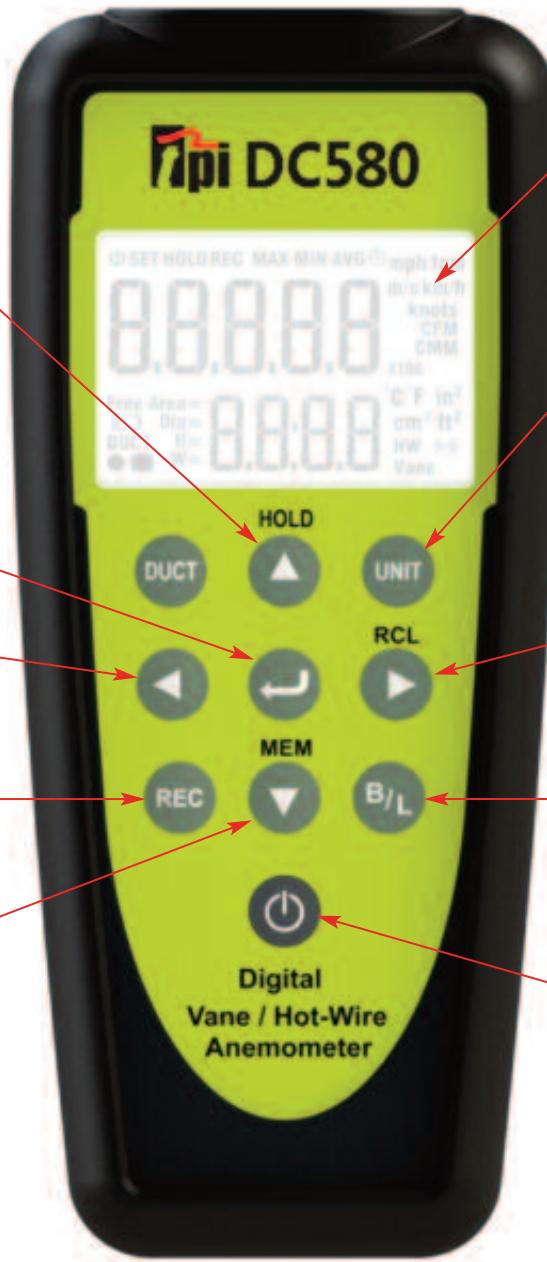
DC580 Photo Actual Size