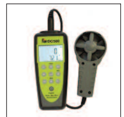
DC580 with vane probe