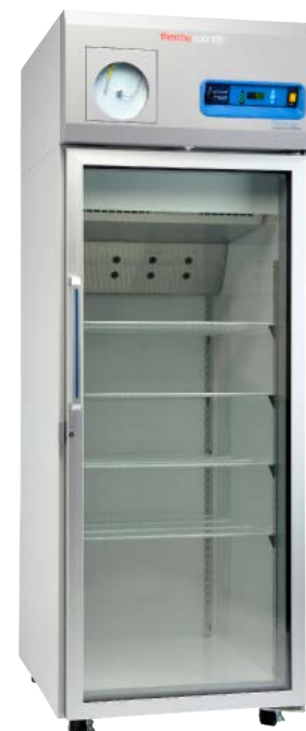
Thermo Scientific™ TSX 23 cu ft refrigerator