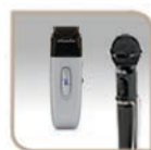
Choice of Transmitters