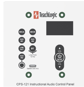
CPS-121 Wall mount control panel with Bluetooth