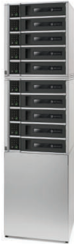
TechGuard 10-Bay Charging Locker with 24" Pedestal Model #: TL10C-K-US