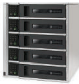
TechGuard 5-Bay Charging Locker Model #: TL5C-K-US