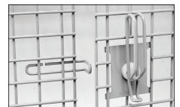
Handle (Open Position)

Shipped Knocked-Down: Saves on freight costs and is easily assembled.