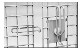
Handle (Open Position)

Shipped Knocked-Down: Saves on freight costs and is easily assembled.