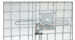
Handle (Closed Position)