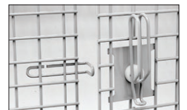
Handle (Open Position)

Shipped Knocked-Down: Saves on freight costs and is easily assembled.