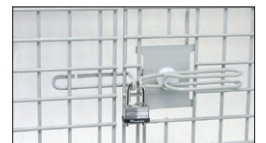
Handle (Closed Position)