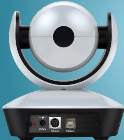
Back of TLC-1000-U2-10