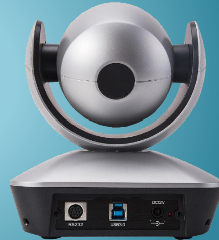
Back of TLC-1000-U3-10