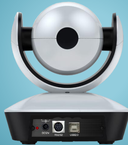
Back of TLC-1000-U2-3