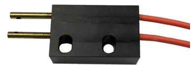
RAA-LT880 Transmissive Head