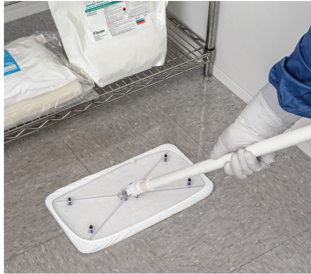
AlphaMop™ 100% Polyester Cover and Pad