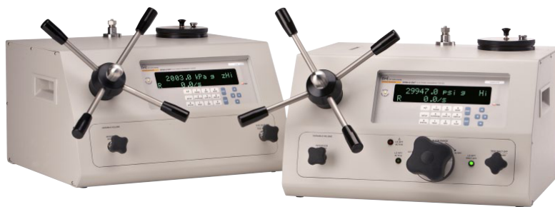
Figure 3. E-DWT-H Electronic Deadweight Tester is a single piece solution for calibrating high pressure hydraulic gauges.