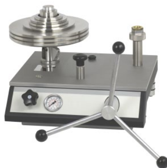
Figure 2. A conventional deadweight tester generates, controls, and measures hydraulic pressure.