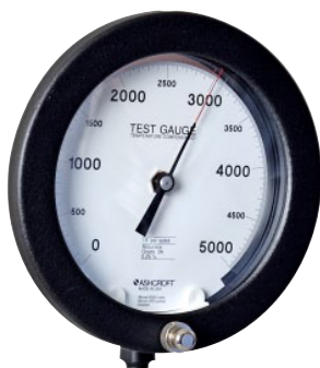
Figure 1. High pressure instruments such as the analog gauge pictured here are often calibrated using hydraulic test media.