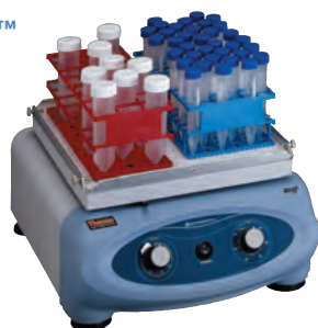
Model Cat. No. Dual Action Orbital/Reciprocating Shaker SHKA2508