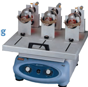
Model Cat. No. Reciprocating Shaker SHKA2506