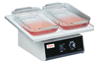
Model Cat. No. Large Rotator 4631Q