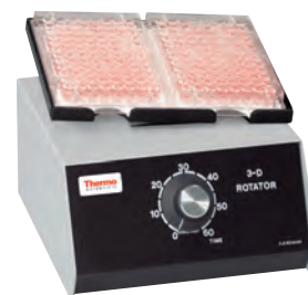
Model Cat. No. Small Rotator 4630Q