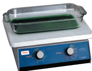
Model Cat. No. 9" x 9" Platform 2309Q 12" x 12" Platform 2314Q