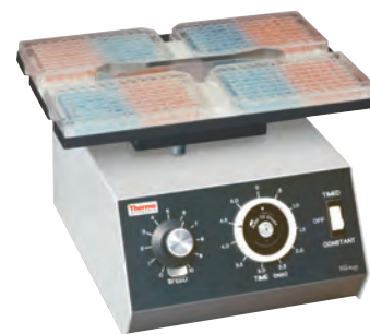
Model Cat. No. Titer Plate Shaker 4625Q