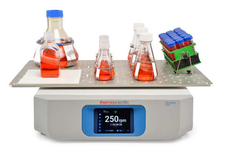
Figure 1: Different vessel types can be used on a shaker as long as they are balanced such that the weight is evenly distributed. If necessary, use a blank vessel as a counterbalance.

Using accessories that are not up to the job puts your work, your shaker, and your labmates at risk. Do the right thing and use only accessories that are designed for your specific shaker. Use the proper clamps for each flask size, rather than stuffing over-sized clamps with packing materials to accommodate the wrong flask size. A shaker with clamps that are easily and quickly changed helps promote safety and best mixing. When using sticky mats or dual platforms, be sure to check the weight, cleaning recommendations, and size limits for use.