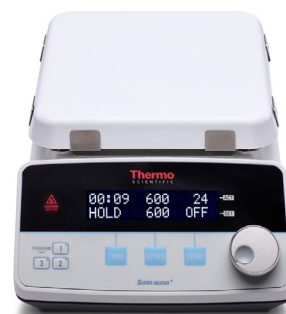
Super-Nuova+ Stirring Hotplate

Includes: PT100 Temperature probe, supporting rod and clamp kit (only for hotplates and stirring hotplates); Stir bar (only for stirrers and stirring hotplate)