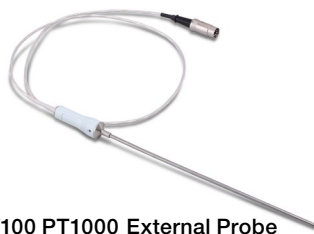
PT100 PT1000 External Probe