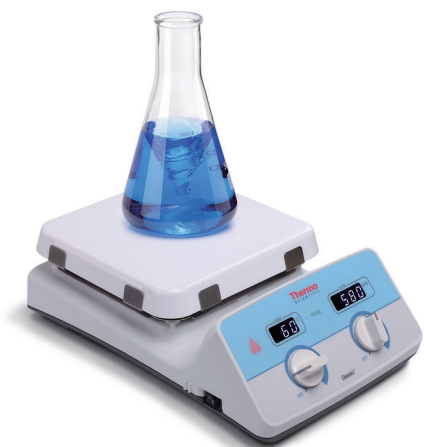
Cimarec + Stirring Hotplate

Please read all the information in this manual before operating the unit.