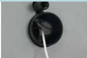
Rear view of the 100 L Advanced Protocol oven with Smart-Vue