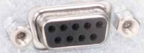
RS232 standard on all General Protocol, Advanced Protocol and Advanced Protocol Security models/sizes

Heratherm incubators offer exceptional data monitoring systems that provide the key to reliable results.