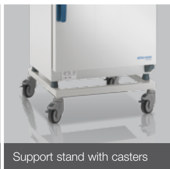
Support stand with casters