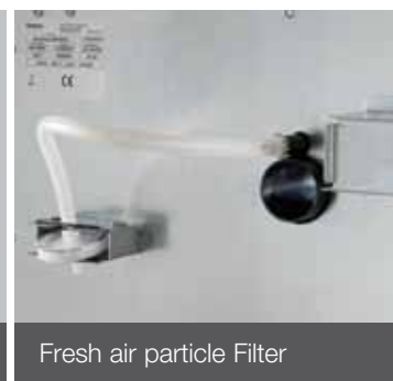
Fresh air particle Filter