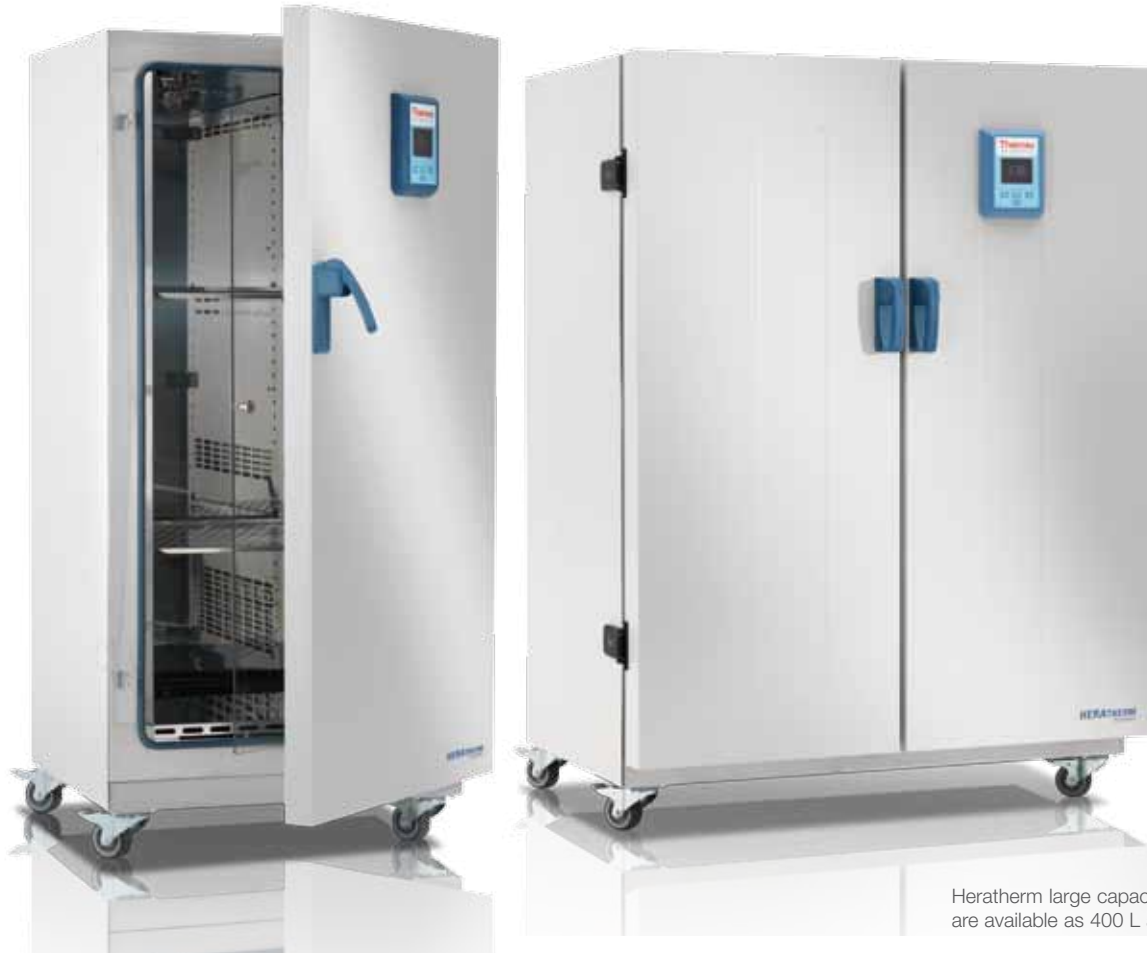
Heratherm large capacity incubators are available as 400 L and 750 L units

Designed with your need for high sample volume or larger samples in mind.