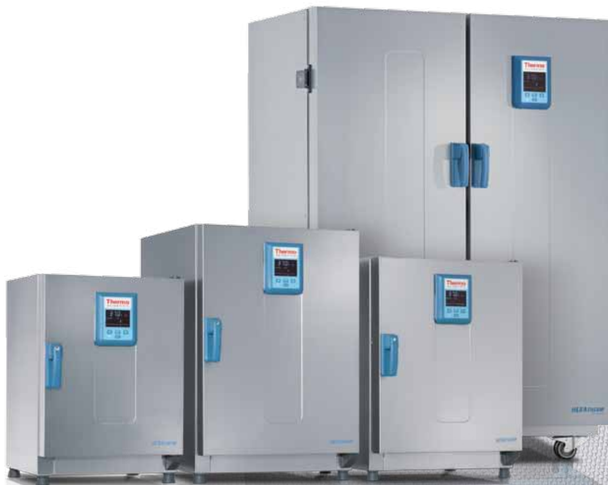
Heratherm Advanced Protocol Security microbiological incubators with stainless steel exterior

An optional stainless steel exterior is available for the Advanced Protocol Security models.