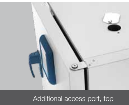
Additional access port, top