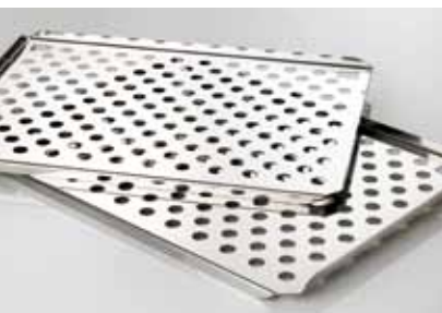
Stainless steel perforated shelves