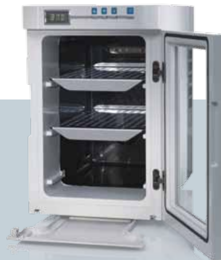
Heratherm Compact microbiological incubator, 18L

smart solution for small volume applications