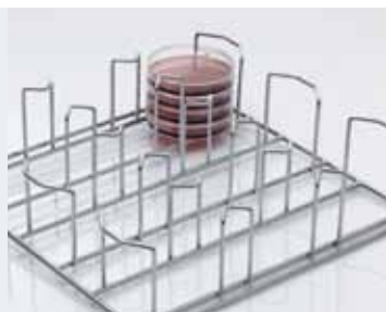
Petri dish holder