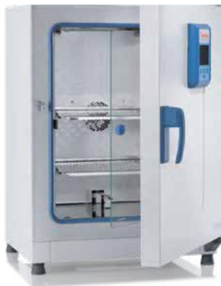
Heratherm Advanced Protocol Microbiological Incubator with unique dual convection, 180 L model pictured