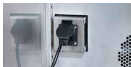
Heratherm Advanced Protocol incubators with internal socket for connection of electrical device (e.g. stirrer / shaker)