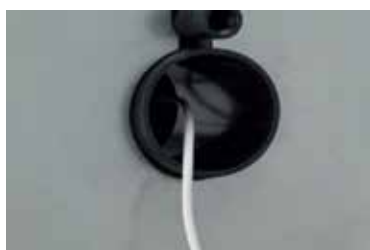
Rear view of the 100 L Advanced Protocol Smart-Vue Wireless Monitoring Solution

Find out more at thermofisher.com/incubators