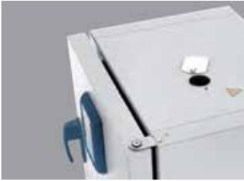
Additional access port top