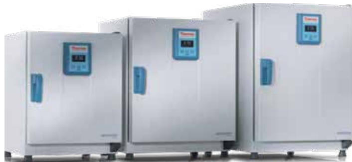
Heratherm General Protocol Microbiological Incubators, 60 L, 100 L, 180 L models