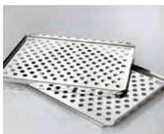
Stainless steel perforated shelves