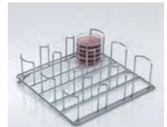
Petri dish holder