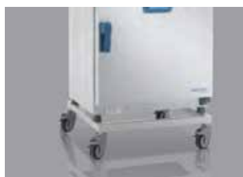
Support stand with casters