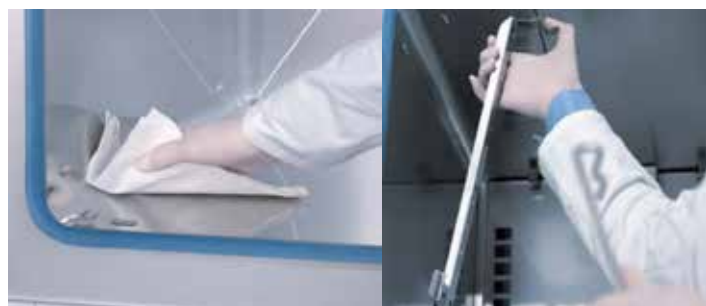
Smooth inner chamber with easy to clean rounded corners